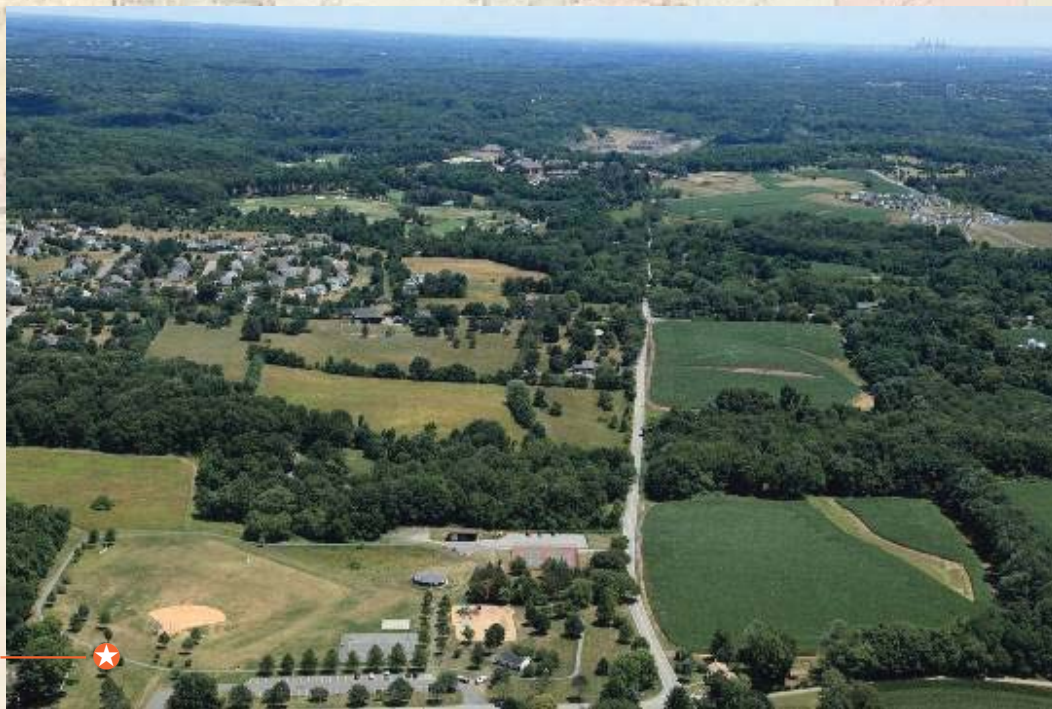
Aerial view of Thornbury township looking east toward Philadelphia skyline, July 2010.

The Board of Supervisors of Thornbury Township Delaware County, along with Thornbury's Historical Society, Parks and Recreation Board, and Historical Commission invite you to explore Thornbury's timeline of history.