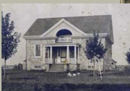
Thornton School on Westtown Road around 1900.

Thornton School's teacher and students gathered on the front steps, c. 1900.