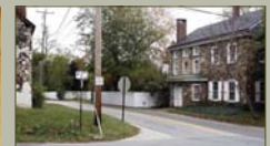
Today, the wheelwright shop exists as a private residence, across the street from modern Cheyney University buildings.